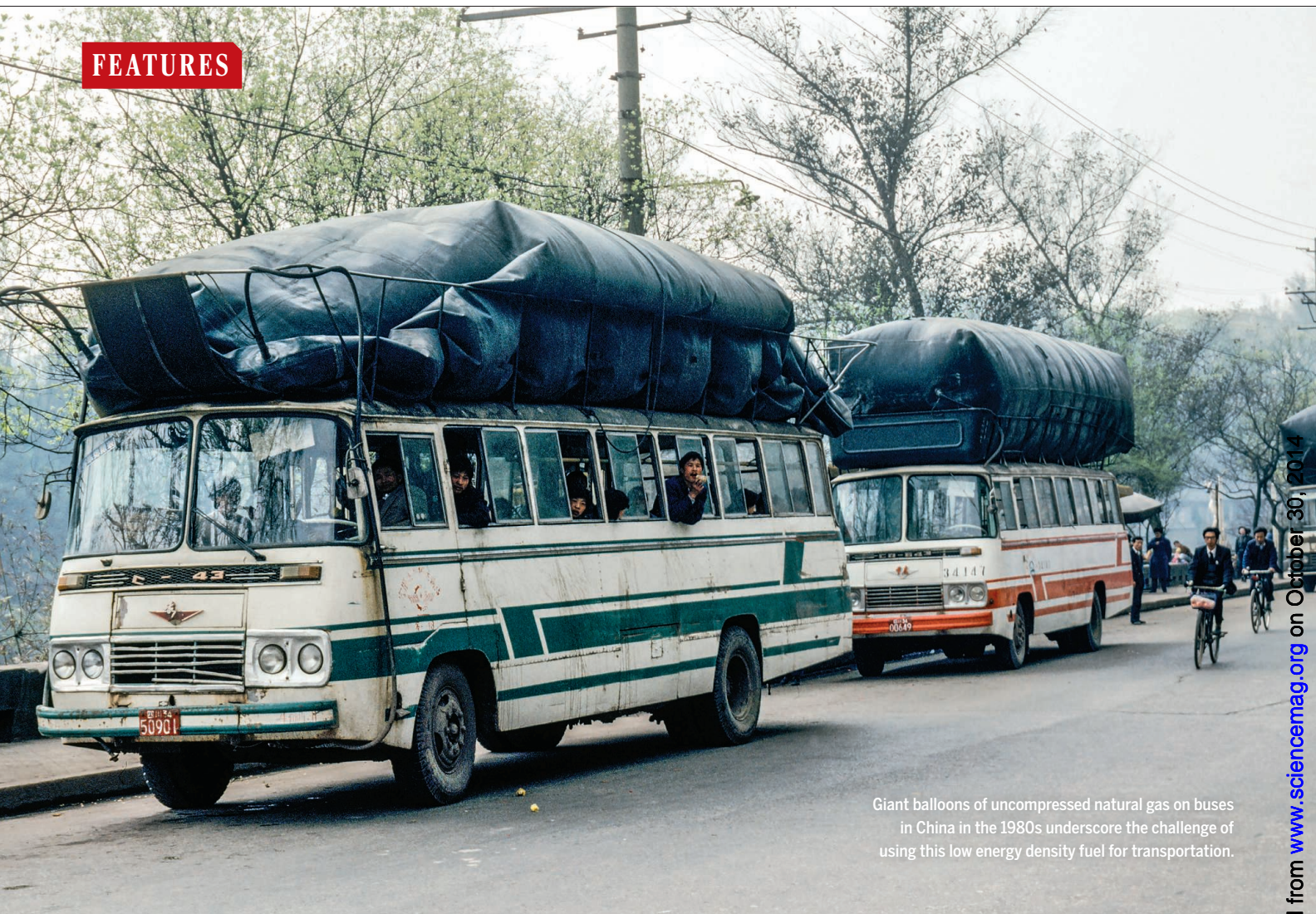
Giant balloons of uncompressed natural gas on buses in China in the 1980s underscore the challenge of using this low energy density fuel for transportation.