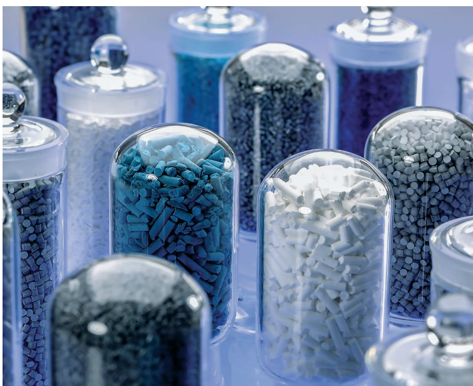
Crystalline metal-organic framework (MOF) materials under development at BASF. The company is working to scale up the production of MOFs to store natural gas.

Company's Youssef. One such compressor is already on the market, Boysen notes. But it costs $5500, a number the MOVE project is hoping to drop by more than 90%.