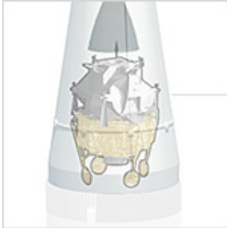
Grand Plans for Moon and Mars, Budget Permitting