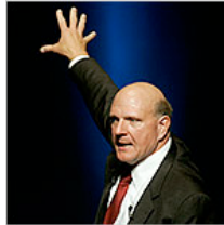
Bing Delivers Credibility to Microsoft