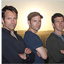
Chasing Terrorists (and TV Ratings)