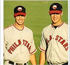
Older Mauer Brother Watches and Waits